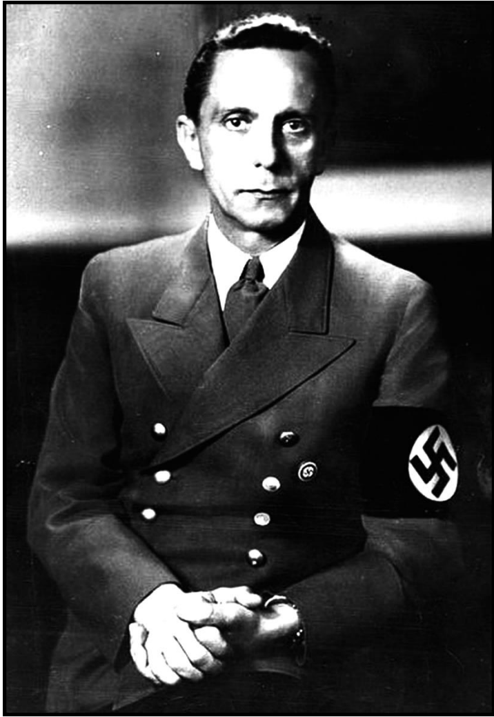
Dr. Joseph Goebbels.