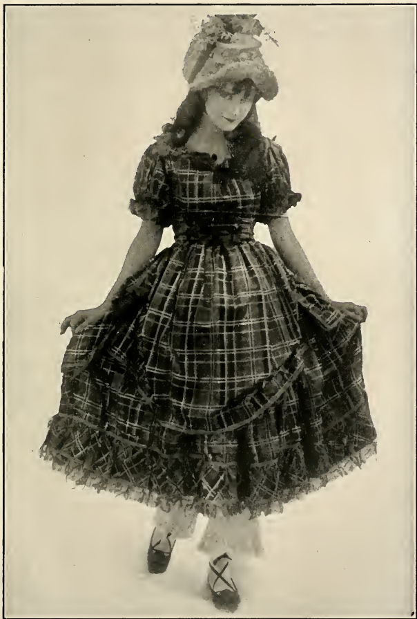
MAE MARSH AS THE VICTIM OF RECONSTRUCTION.