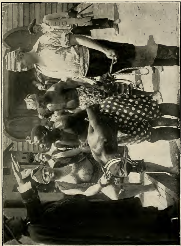
THE BLACK MASTERS OF THE SOUTH DURING RECONSTRUCTION. From "The Birth of a Nation."