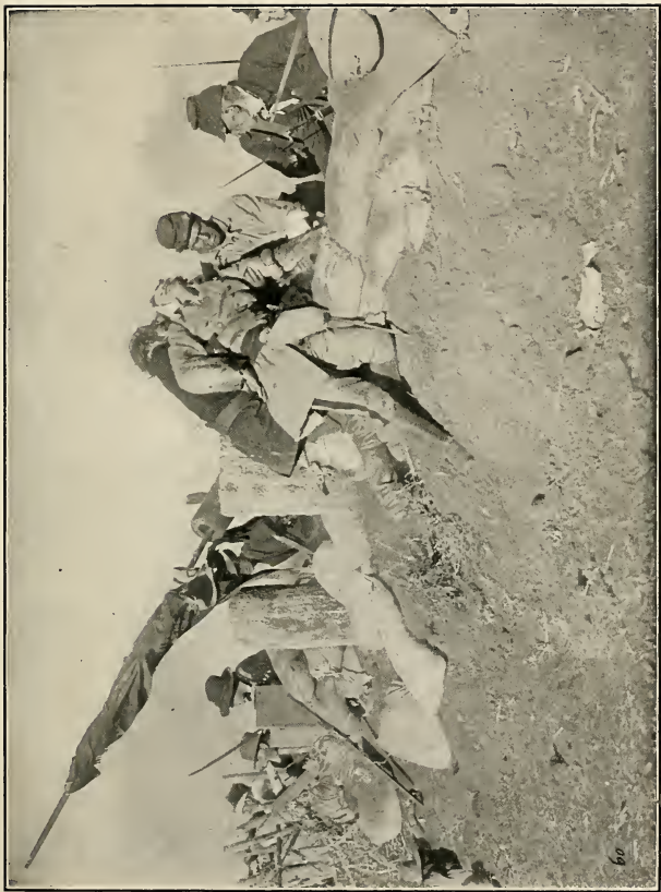
60 “YOUR BROTHER SPRANG FORWARD AND CAUGHT HIM IN HIS ARMS.” From “ The Birth of a Nation .”