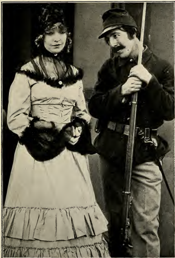
LILLIAN GISH AS ELSIE, AND THE SENTINEL.