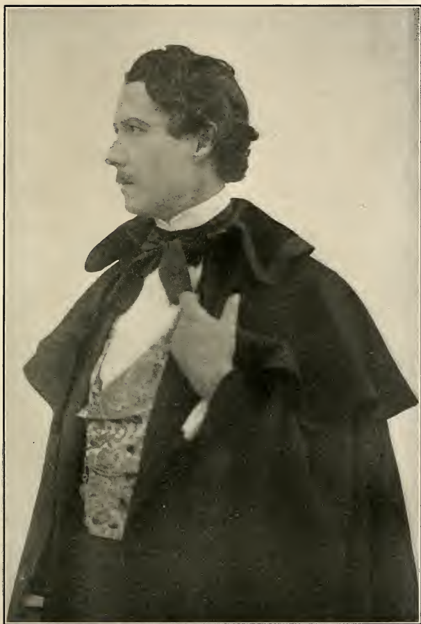
HENRY WALTHALL AS BEN CAMERON.