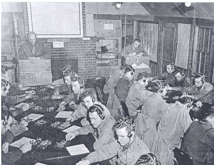
Communications school class in coded telegraphy at Training Area C.

Area E, two country estates and a former private school about 30 miles north of Baltimore, was created in November 1942 to provide basic Secret Intelligence and later X-2 training—as a result, RTU-11 became the advanced SI school. Area E could handle about 150 trainees. When the Morale Operations Branch was established to deal in disinformation or psychological warfare, “black” propaganda, men and women of the MO Branch also trained at Area E, although men from MO, SI, and X-2 often received their paramilitary training in the national parks. 30