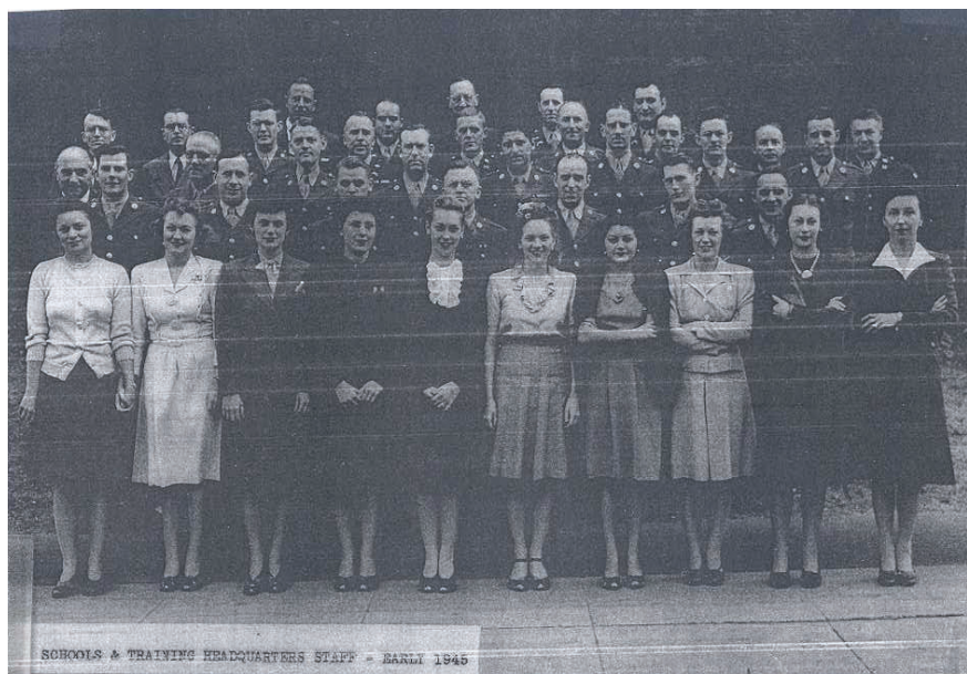
Schools and Training headquarters team, at its peak size, in early 1945.

OSS direct action training had its strengths and weaknesses; the latter, as even the Schools and Training Branch acknowledged, had been particularly evident in the early stages of its evolution. Until combat veterans began to return in the fall of 1944, few of the stateside instructors had any opera-