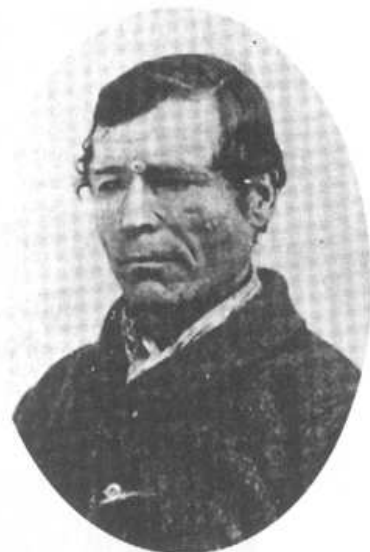
Survivors of White Slavery