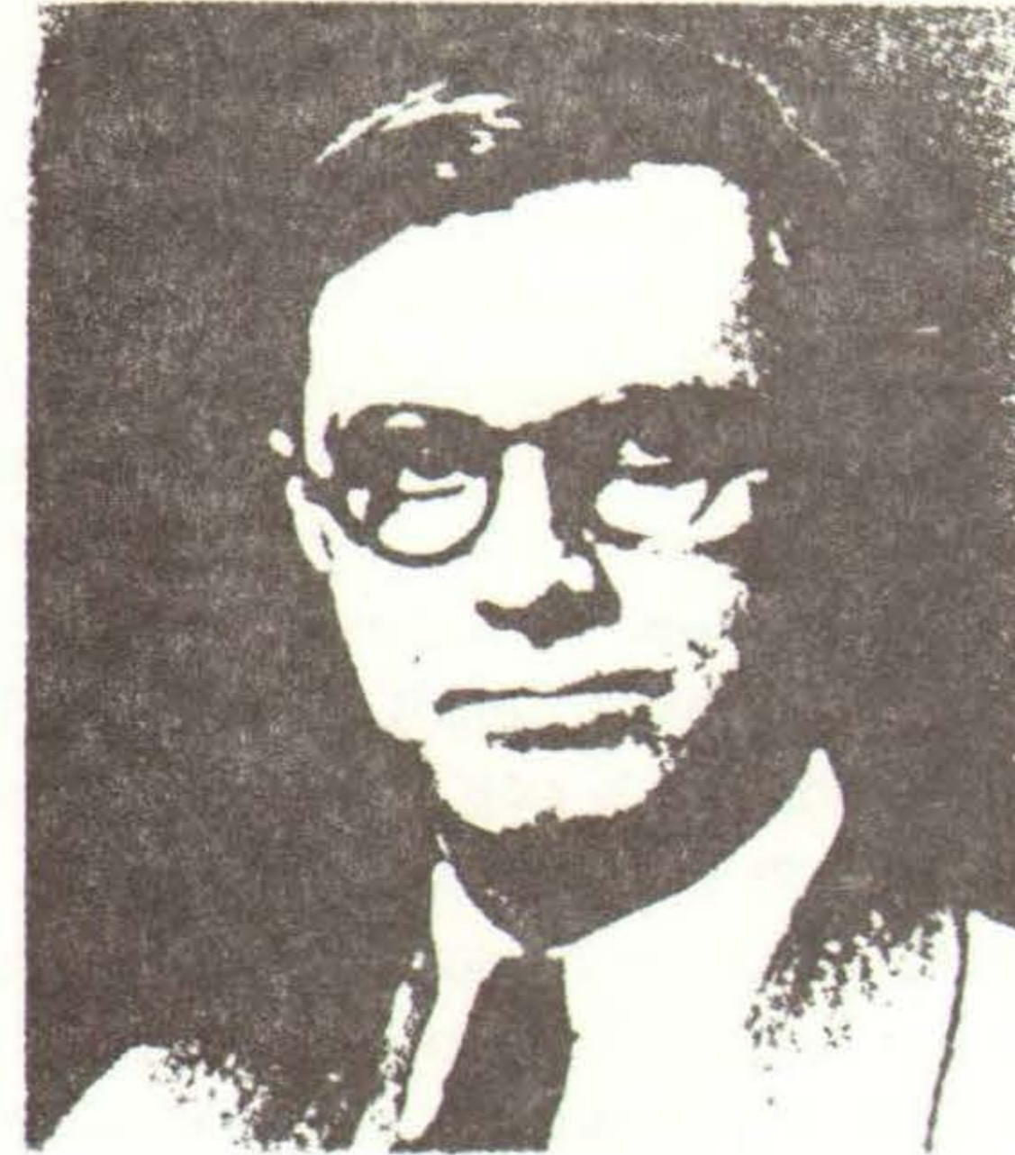
Gene Talmadge ( 1884 - 1946 )