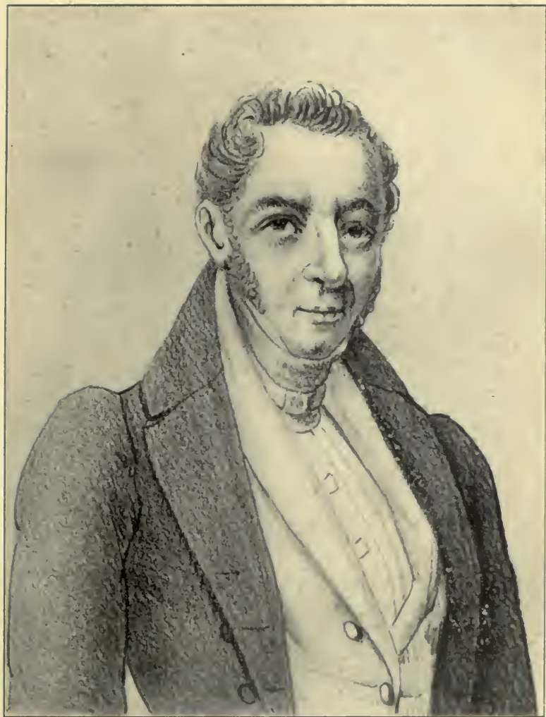
BARON ANSELM MAIER ROTHSCHILD.