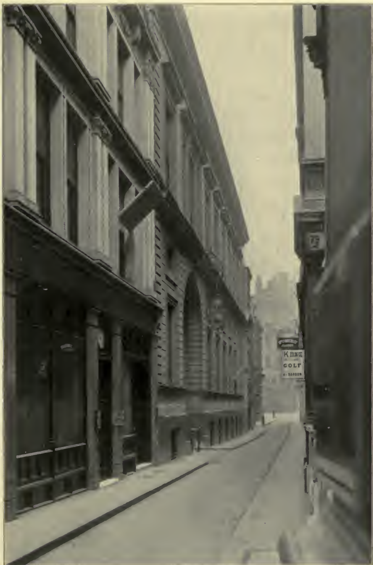
THE ROTHSCHILD OFFICES, St. Swithin's Lane, London, E.C. (House on the left with ornamental hanging sign.)