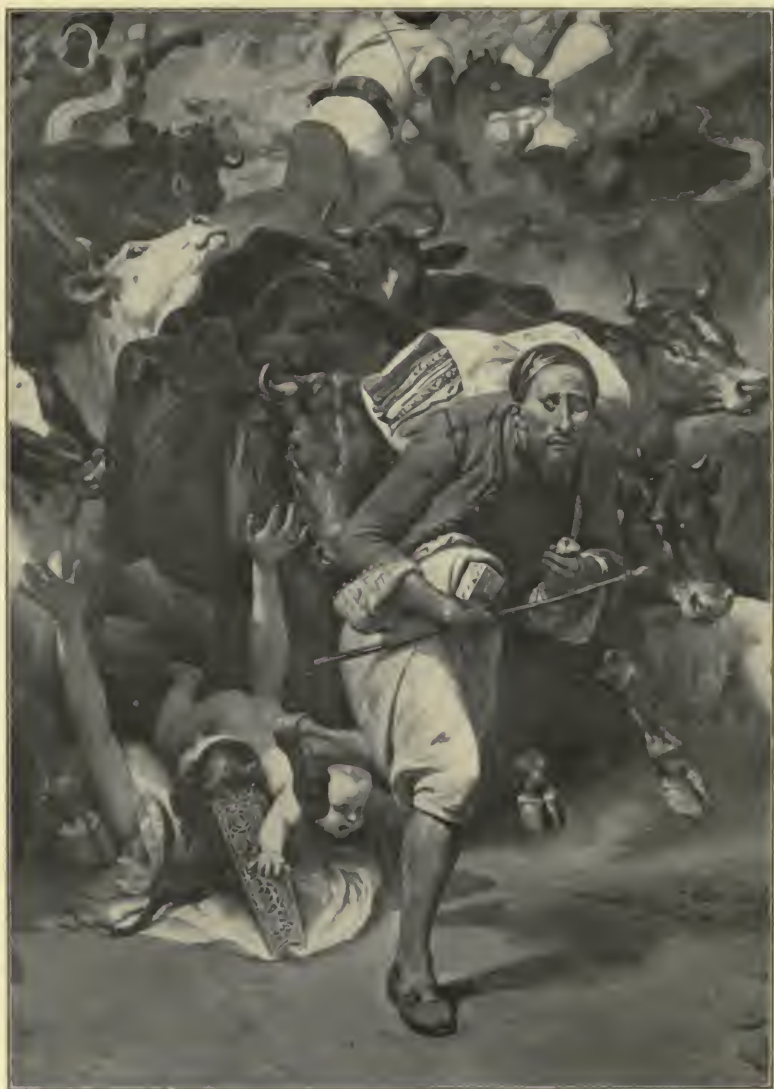
FIGURE OF TERRIFIED JEW IN VERNET'S FAMOUS PICTURE.