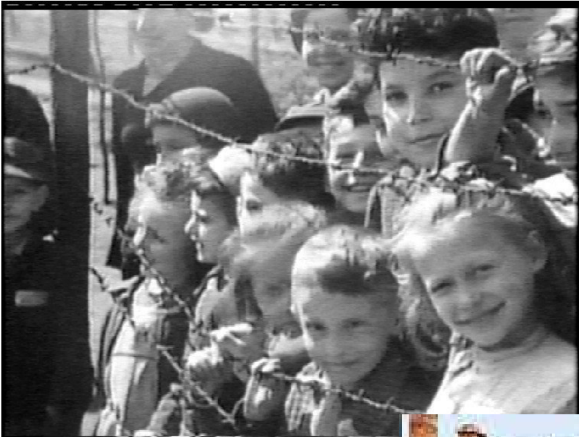
LEFT: Another picture of the children of the Bergen-Belsen camp (the little scamps again leaning on the camp's "electrified fence"), less often published than the one with Moishe's story.