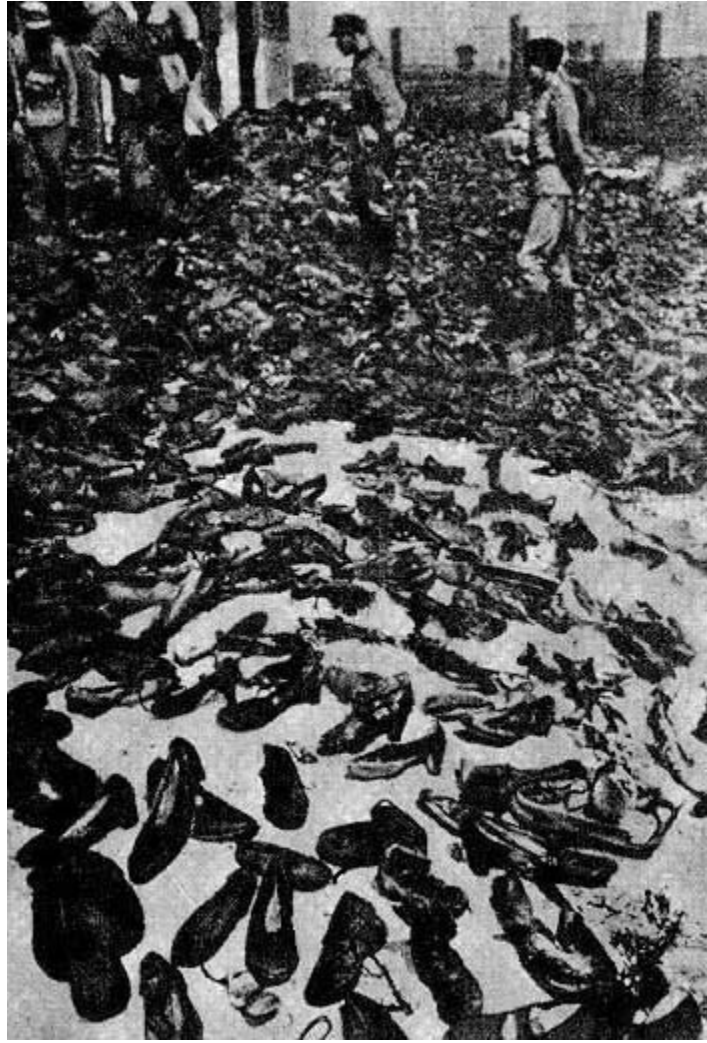
This picture appeared with no caption at all in The Lublin Extermination Camp , by Constantin Simonow, Moscow, 1944, page 12.

One would wish that the Exterminationists would at least get their stories straight. Were the shoes found at Auschwitz or at Lublin? (Actually, it is also worth noting here that Lublin is the same thing as Majdanek or Majdanek, but is a hundred miles from Auschwitz-Birkenau.)