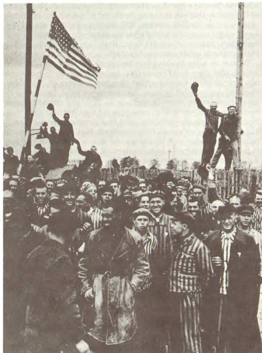
Dachau prisoners on liberation day. Again, compare the physical condition of these inmates with the emaciated bodies whose deaths are attributed to gassing in the camp. Victims of gassing should include bodies in healthy condition.