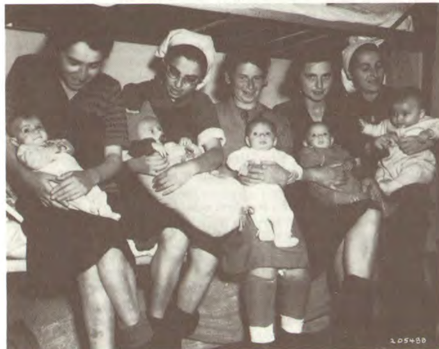
Jewish babies at Dachau. These Hungarian Jewish women and their babies were photographed on May 1, 1945, two days after the liberation of the camp. The official US Army caption reports that these Jewish babies were born during the final months of German control of the camp.