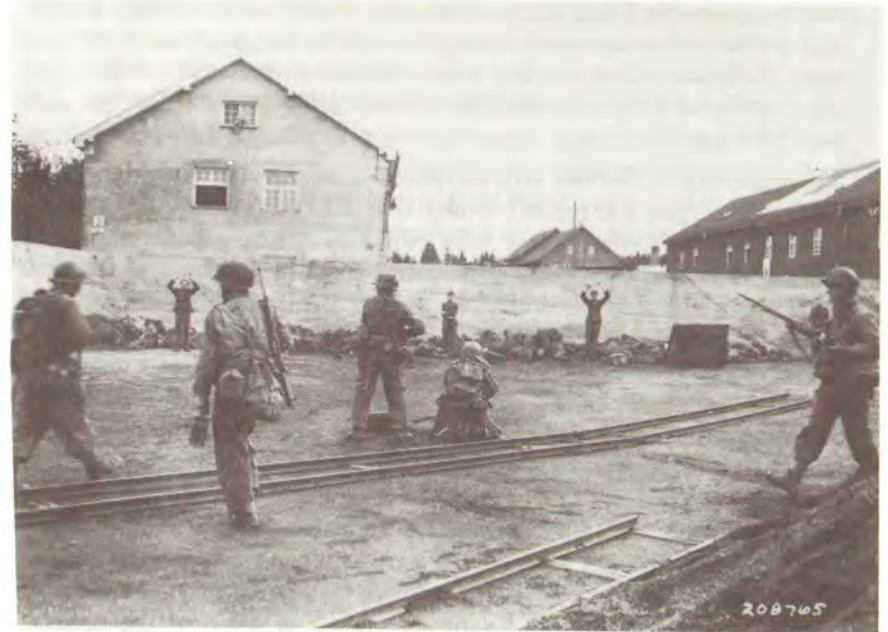
American soldiers who liberated Dachau summarily killed 520 of the 560 German camp personnel who had surrendered. Here, soldiers of the 157th Regiment, 45th Division, have just machine-gunned a group of about a hundred German prisoners. Four who were missed are still standing; they were killed moments after this photo was taken. No one was ever punished for this atrocity.

In spite of the eyewitness accounts we have recounted here,