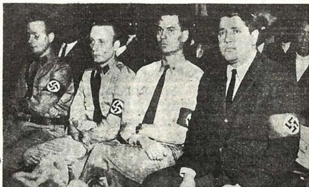
George Lincoln Rockwell (second from right) and three members of his American Nazi Party are intent listeners in the International Amphitheatre. They attend Chicago Muslim organization's first major rally of 1962.