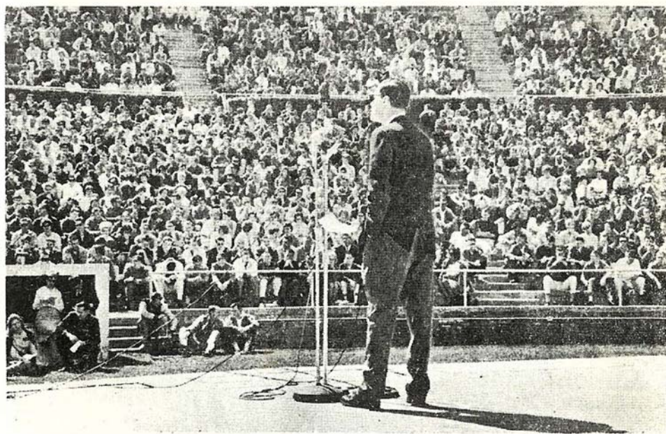
Part of the huge crowd in the Amphitheater listening to the damning facts about the Jew-Communist conspiracy against America and the White Race; San Diego State College, San Diego, California.

BUT IT IS IMPOSSIBLE TO IGNORE THE MASS AND MOB ACTIONS WHICH ARE THE JEWS' ONLY REPLY TO OUR PUBLIC EXPOSURES OR TO IGNORE OR MISUNDERSTAND THEIR IMPLICATIONS!