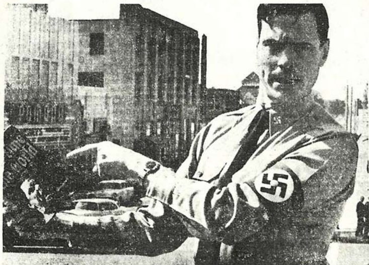
'TOMORROW THE WORLD' —Self-styled "Fuehrer" of American Nazi Party, George Lincoln Rockwell, points to his recent book on party's aims. Rockwell is in Pomona on week-long visit to organize Nazi Party in Los Angeles area. Rockwell

At the press conference the next day I was able to get a tremendous amount of truth into the papers and TV and other media of Los Angeles, which must have awakened a great many people as to what it is we are really trying to preach and do.