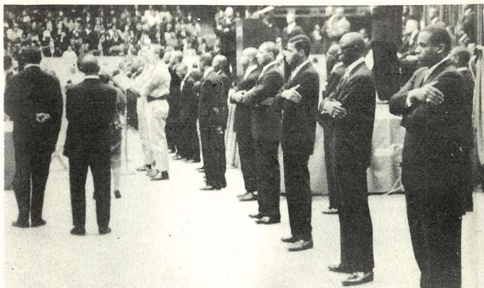
Commander Rockwell speaking at the Black Muslim convention, Feb. 1962

A great hush fell over the packed hall as he began to speak. Elijah Muhammad did not back away one inch from his support of the truth, regardless of who was preaching it. He said, "I take my hat off to any white man who wants to stay white! I do not want to be white! I want to be what I am! I do not want the white man's woman. I want my own woman!"