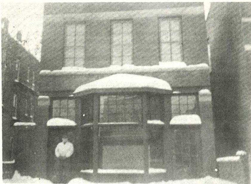
Party Headquarters at 2124 N. Damen Street, Chicago,