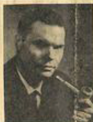
George Lincoln Rockwell

With the blood of slain White policemen and firemen still running red in the gutters of Detroit, the chicken, "nigger-loving" politicians were getting ready to prosecute for murder--NOT the savage Black killers who started the burning and murder--BUT THREE WHITE POLICEMEN!