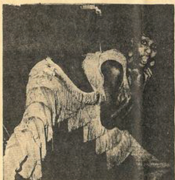
ALL TOGETHER NOW, SOUL BROTHERS! CHEER! WE HAS GOT "HIU - MAN DIG - NI - TEEEEEEEE!"