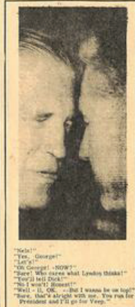
"Well..." "Yes, George!" "Yes, George! - NOW!" "Well, who does what LBJ's think!" "You'll let Dick..." "I won't, Roosevelt!" "Well... U. OK... - But I want to be in right..." "I'll be right with you, you go to President and I'll go for Vesp..."

Since the OEO is so all-fired enthusiastic about converting 14 inch rifle sights into tiny microscopes, we are offering them our conversion kit for installing Hoover Dam at the OEO building as a drinking fountain.