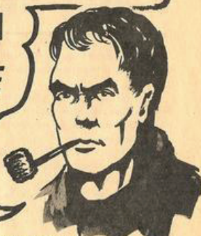
George Lincoln Rockwell