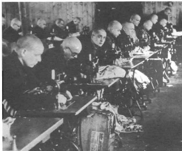
The tailor shop at Sachsenhausen

No one denies that the camps were horrible places -- both for the inmates and for the staff. Toward the end of the war, conditions in the camps deteriorated very rapidly due to Allied bombing of the rail and road distribution networks. Germany was deliberately starved into submission by Allied bombing and blockades. Many thousands of Germans also starved to