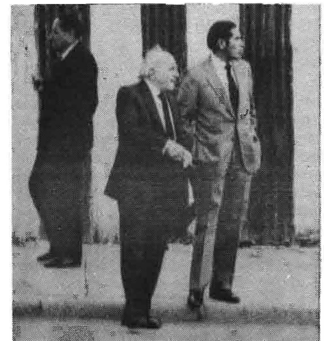
Barbie and bodyguards in La Paz, Bolivia, in 1982

International lawyers will admit that the French and Bolivian governments committed a criminal act in Barbie's arrest and abduction to France. While an extradition request by France and West Germany was under study by the Bolivian Supreme Court, Barbie was jailed on failure to pay a 6-year-old debt of $10,000 to a mining company. He made good, but instead of being released, was ordered to leave the country, although he was a Bolivian citizen. The whole affair had been cooked up by the French and the new left-wing Bolivian government, which was in the midst of a cabinet crisis and wanted to establish a "democratic image" and possibly get a French loan. Together with most of his top-level advisers, Mitterrand was in on the conspiracy from the very beginning. Ten days before the kidnapping, he dispatched a government plane to French Guiana where, at the agreed-upon time, Bolivian authorities delivered a handcuffed Barbie.