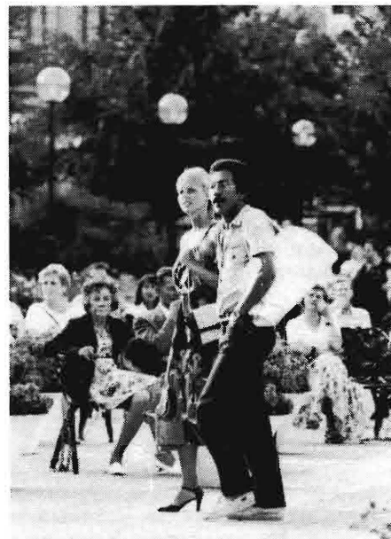
Swedish street scene

During my stay in the capital, I was introduced to a leader of a relatively new organization dedicated to the preservation of the Swedish people and Swedish culture. This handsome, personable young man showed us slides from a recent demonstration at Uppsala, an old university town and one-time pagan religious center about 40 miles north of Stockholm. A mixed-race leftist mob had recently greeted the handful of white survivalists there with the same un-