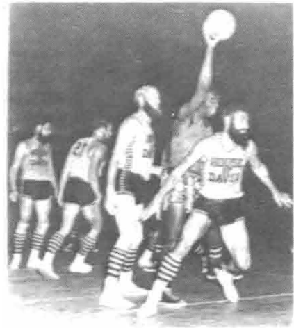
Tenants 110, Landlords 0.

spends six hours per day "thinking about guys," two hours "sipping diet drinks," and 1 1/2 hours "giving Iranian students the brush-off."