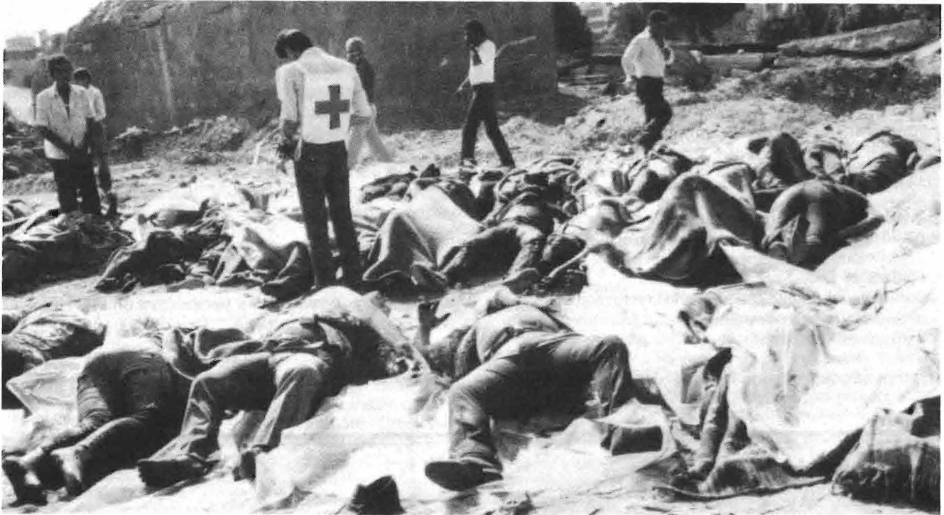
Sorting out some of the bodies of the Sabra and Shatila massacre. These murdered Palestinians and some 40,000 other inhabitants of Lebanon would still be alive if Sharon had not invaded the bruised and battered little country.