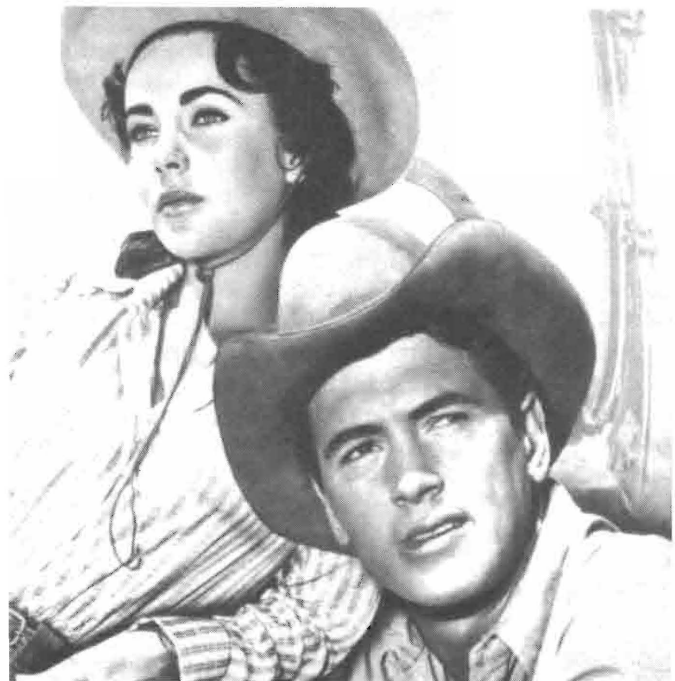
Liz and Rock. Did she know what his fans didn't?

Then, just when the gays thought they had it made, up popped AIDS. All of a sudden, the mediocrats and their ilk were no longer eager to woo the lavender laddies. Hollywood, infested with gays, still puts on AIDS relief benefits, but actresses are ever more skittish about long stints of kissing and other more intimate scenes in R- and X-rated films. They wonder if their screen or TV lover might be another Rock Hudson.