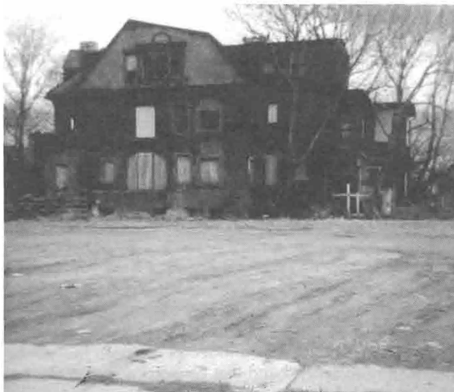
This mansion once saw much better days