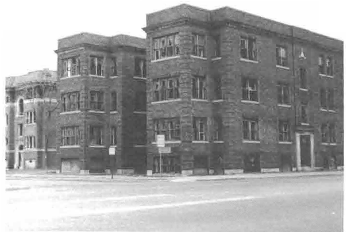
Wrecked, vandalized and abandoned apartments