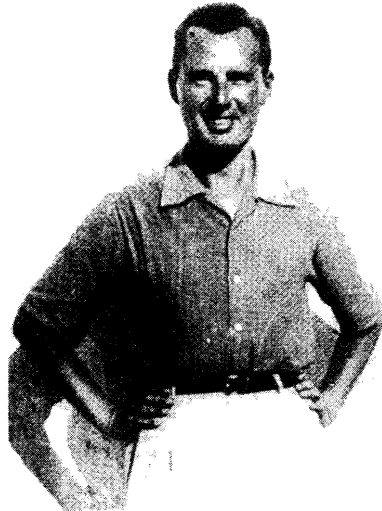
A sunburned refugee in sunny Spain

Degrelle has been forbidden to set foot in his own native country, which has banned all his books and writings and all radio and TV interviews. The English translation of his incredible wartime experiences, Campaign in Russia: The Waffen SS on the Eastern Front , is available from the Institute for Historical Review (P.O. Box 1306, Torrance, CA 90505) for $17.95.