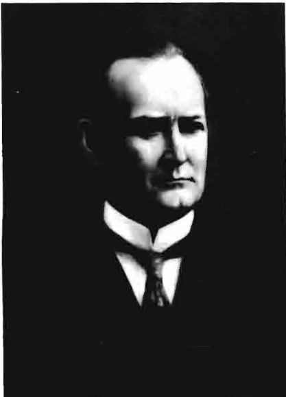
Gov. John Slaton