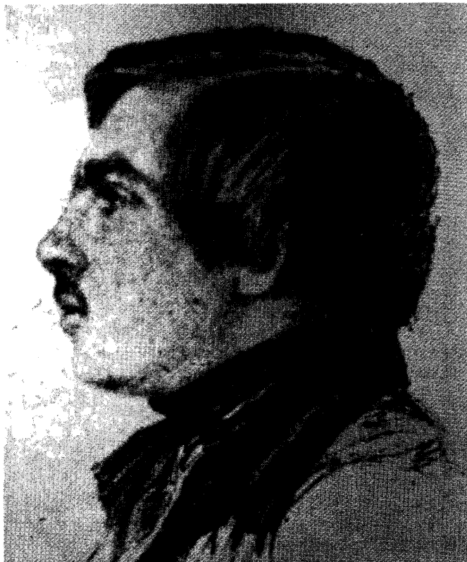
Engels as a young man

For (the elder) Hegel, the state reconciles the family with civil society. For Friedrich Engels -- who typifies the Young Hegelians in his uncompromising "radicalism" -- civil society contradicts the family, overthrows it, only to be overthrown, itself, by a new "proletarian" order. Engels' ideas, which he developed in detail in two books, The Origin of the Family and Socialism: Utopian and Scientific , directly contradict Hegel's mature view and open an entirely new phase of the dialogue on the nature of man and society.