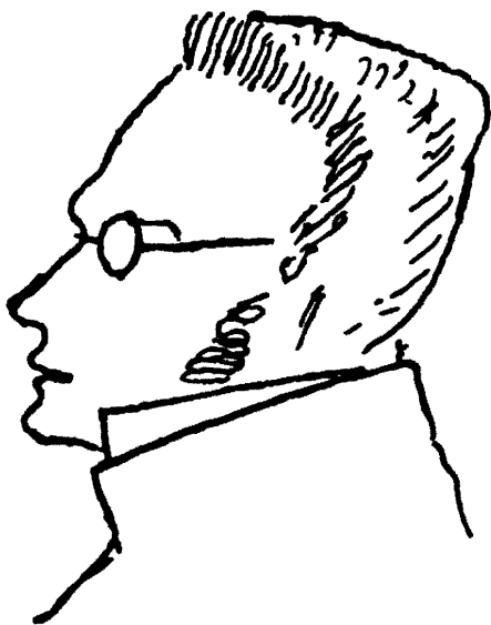
Stirner as drawn by Engels

recognition of the power of his opponent's ideas. What Engels did not foresee was the shape Stirner's philosophy would take when developed by Friedrich Nietzsche, who proved everything Engels said about Stirner to be an understatement.