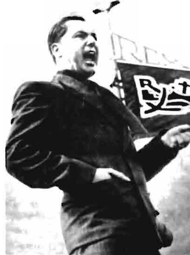
On the stump in 1938

the next few months in a Spanish military hospital, much of the time in a neck-to-foot plaster cast. All the while, the Allies were trying to get Franco to release him so he could face one of those fixed-in-advance kangaroo courts and Star Chamber affairs which the media dubbed war crimes trials. Franco refused to give him up, however, and helped protect him by giving him a false identity.