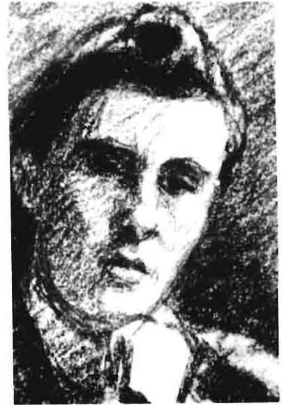
At the tender age of 18, before he turned from poetry to politics

His geopolitical scheme was getting nowhere when Germany invaded Russia in the summer of 1941. Assessing the conflict as one between civilization and barbarism, as a do-or-die attempt of Europeans to throw off the alien Communist virus which was sapping the lifeblood of the West, he put aside his politics and joined a fighting force of Walloons (French-speaking Belgians) that was affiliated with the Wehrmacht. Offered a commission by Hitler, he signed on as a private in order to work his way up through the ranks. His Walloon Legion was later merged with the Waffen SS, the elite force with which he fought bravely and unceasingly on the Eastern Front. In spite of five wounds -- one almost mortal -- and some 85 face-to-face encounters with the enemy, he rose so high and fast in the command structure that before the German collapse he was the General of the Viking Division and had been awarded the highest German military decoration ever given a foreigner, the Knight's Cross of the Iron Cross with Oak Leaves.