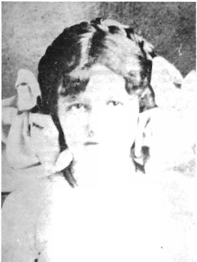
Mary Phagan -- symbol of Southern womanhood

From Mount Olympus or Stone Mountain, the Frank controversy can be viewed as a struggle between two races with a long history. Southerners of 1913 still imagined they were a people with a chivalric past. Haunted by images of cavaliers, moonlight and magnolias, they would never turn their backs on the tragic end of a little girl violated and killed by an outsider. Mary Phagan was not just an ordinary human being; she was a Southern girl. Her fate shocked Southerners of both high and low estate. The "lynch mob" was made up of leaders of Marietta society, including retired judges, businessmen and ministers. Those men decided to fight against what they saw as a relentless media and political campaign to ensure that justice was not done.