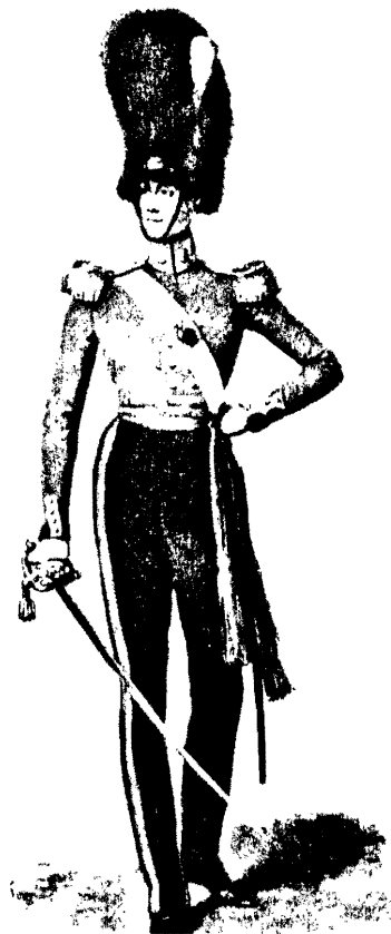
Grenadier Guards officer (circa 1832)

The influx of West Indians, who have no historical or cultural connection with the Division, if it is permitted, will irreparably damage both the unique family atmosphere and the morale of the soldiers, therefore undermining the social fabric that has guaranteed the success of the five regiments. There is no support for this policy of integration from the soldiers themselves, who form a large reservoir of nationalistic sentiment and who are, by and large, opposed instinctively to multiracialism.