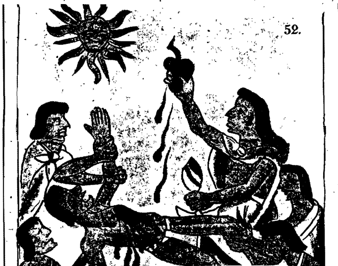
Pulling out the victim's heart was the climactic event in Aztec religious rites.

The Indians who did manage to live through their holocaust were seldom the finest examples of their peoples. The Indian nobility, if you want to call it that, was largely