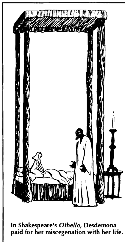
In Shakespeare's Othello , Desdemona paid for her miscegenation with her life.

Every day I see white kids entering prison. And with each successive wave I see cultural bastardy more breath-