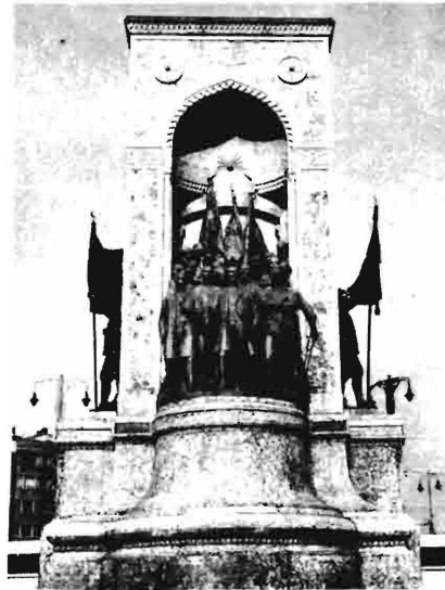
Kemal Ataturk monument. For Turkey smaller was bigger.

which started in the middle of the 18th century has now run its course. The number of Germans began to decrease in 1973. By 1985, Denmark, Hungary and Austria also "had negative rates of natural increase," along with the white populations of the Soviet Union, the U.S., Britain and France. While the West is at the end of its population growth, most Asian, African and Latin American societies are at the beginning or in the middle of their demographic expansion.