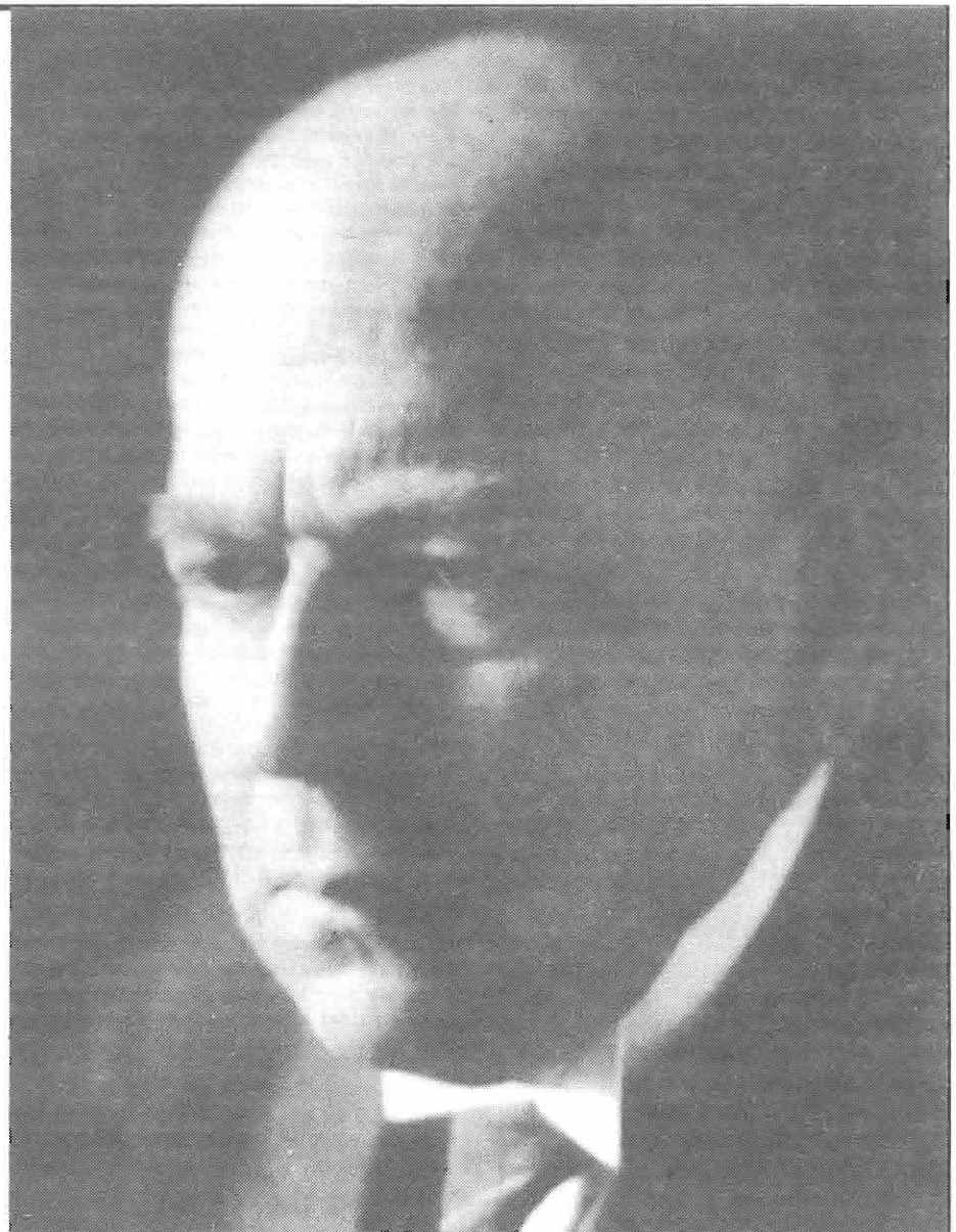
Oswald Spengler 1880—1936