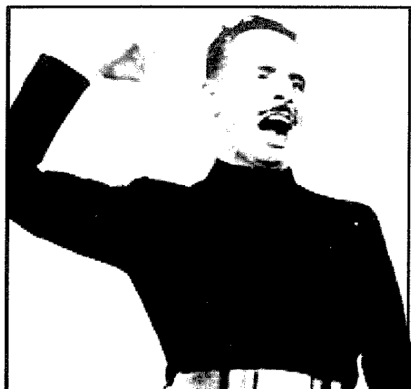
Oswald Mosley Leader of British Union, speaking at one of his great meetings.