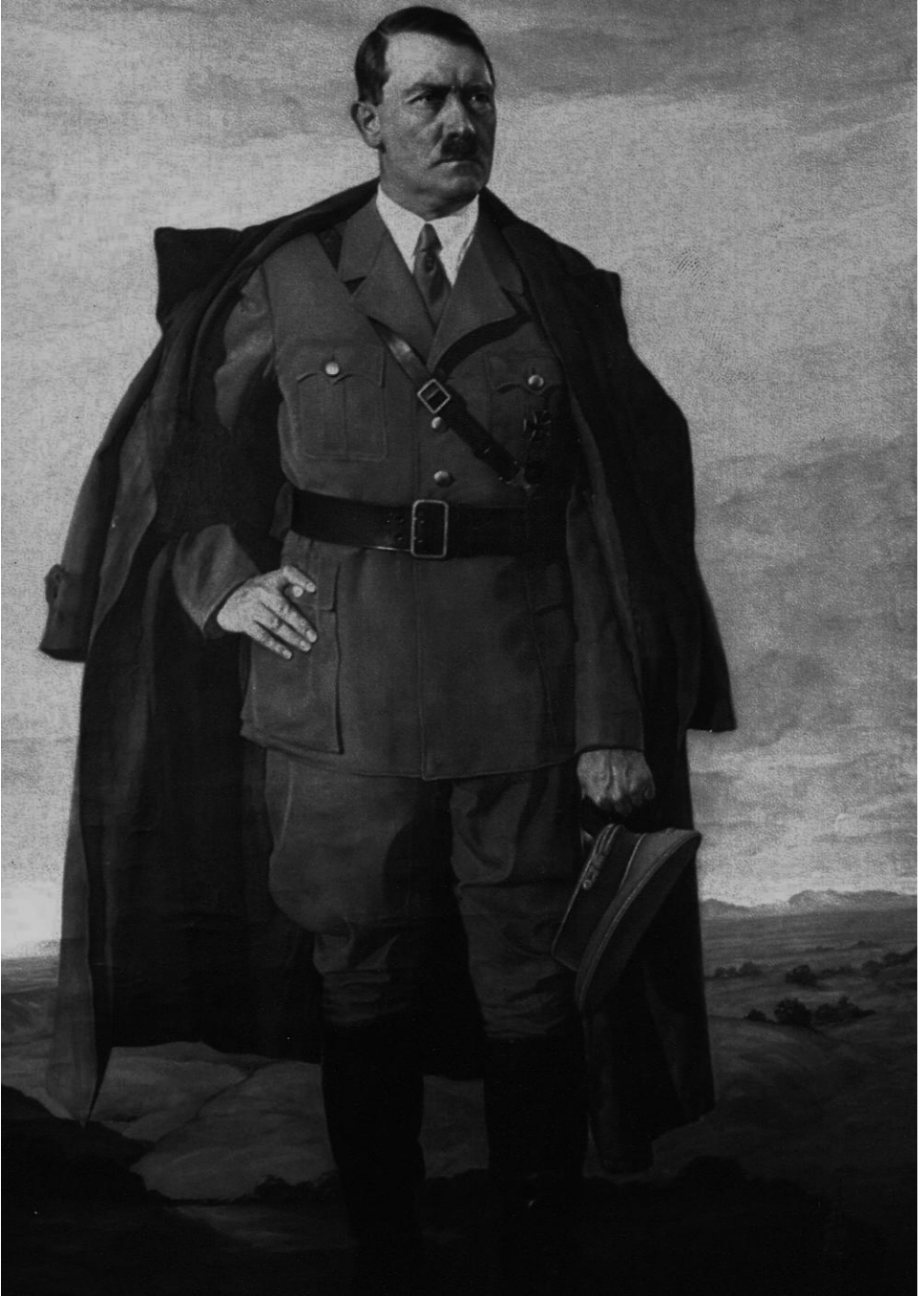
Adolf Hitler, unser Führer