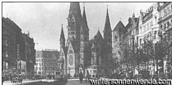
Berlin's centrally located Kaiser Wilhelm Memorial Church, as photographed in 1932. Like so much of Europe's grand and impossible-to-replicate architecture (overwhelmingly replaced by the mundane and the vulgar), it was a casualty of World War II saturation bombing raids, its burned hulk preserved as a reminder of war's devastation. Throughout the war, in common with the Western Allies and in total contrast to the National Socialists' mortal enemy, the Soviet Union, Catholic and Protestant chaplains served with units throughout the Wehrmacht.