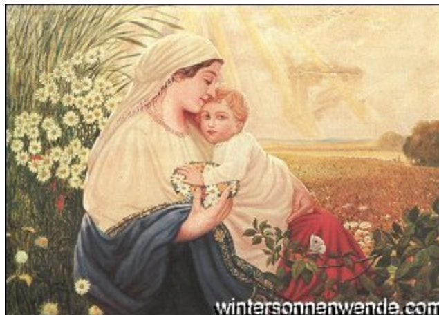
"Mutter Maria" ("Mother Mary"), oil painting Created in 1913 by... Adolf Hitler.

3. The National Socialist state has neither closed a church nor obstructed any religious service, nor influenced the form in which a religious service was held. It has not influenced the teachings, nor the creed, of any denomination whatsoever. In the National Socialist state