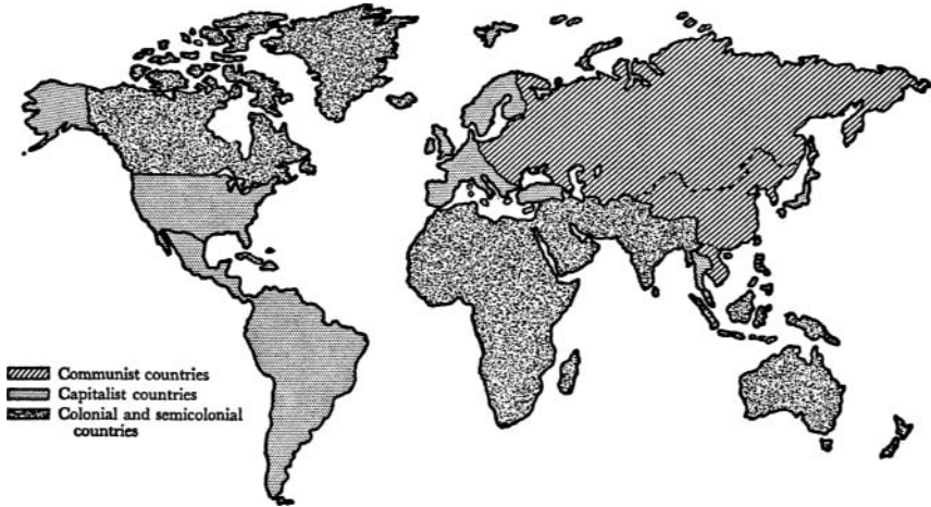
Figure 4. Ideological Map of the World as Seen by the Chinese Communists in 1951