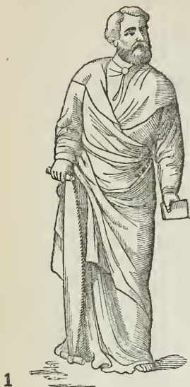
FIG. I.—Page 135.